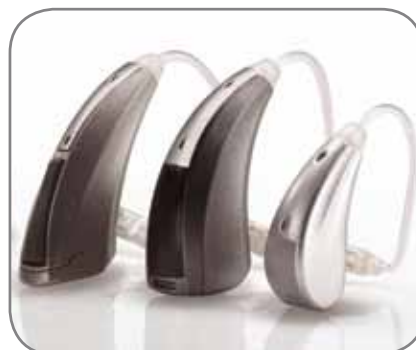
Figure 4: Wi Series and X Series RIC 312, Wi Series and X Series RIC 13, and X Series Xino™ RIC 10.