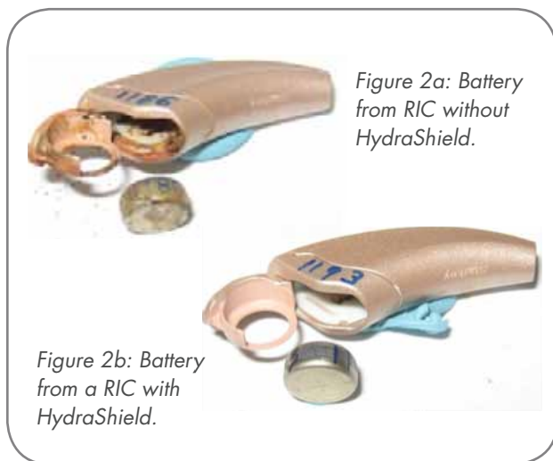
Figure 2a: Battery from RIC without HydraShield.