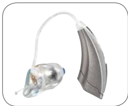
Figure 3: RIC Absolute Power.

The lessons learned from market research, in conjunction with market demand, provided input into the requirements that fed development and clinical validation of Starkey's comprehensive RIC family: the Wi Series and X Series™ RIC 13,